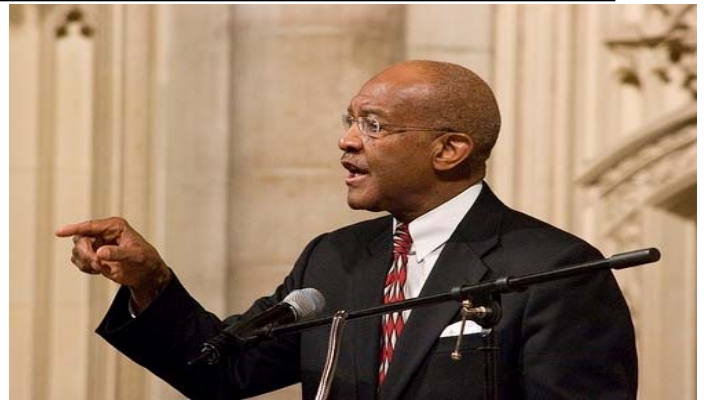
Rev. Dr. James Forbes, Jr. Featured Speaker at Peace Pilgrimage